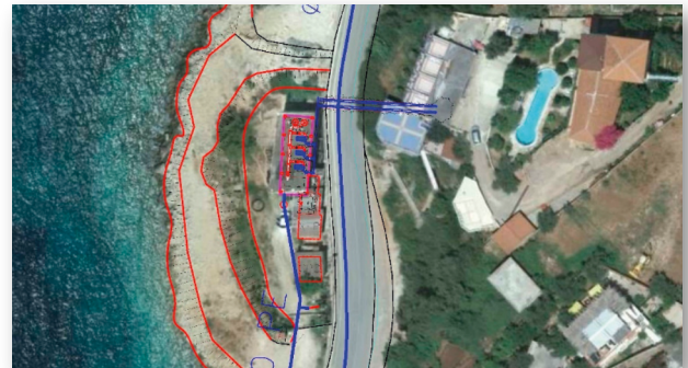
Aerial view of Pumping Station 6 - Rehabilitation of Sea Water Protection Dam

Key impact: 24/7 water supply for over 95,000 inhabitants