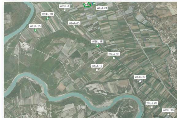
Karafaj Well Field - Rehabilitation of 4 wells and drilling and construction of 3 to 4 new wells

Key impact: highly improved water network and control system - enough water available 24/7/365