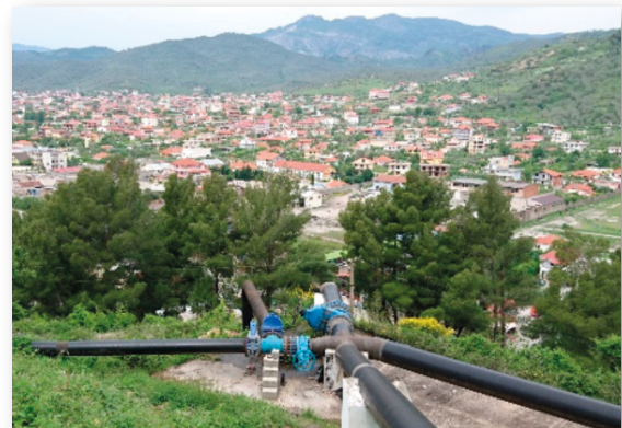
Water pipe from reservoir Krasta e Madhe

Key impact: highly improved water supply - new control system - safe wells